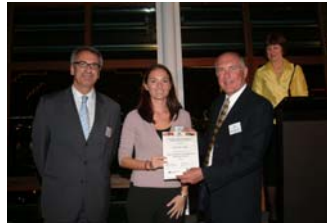
Jacynta Fong receiving EMD Course certificate from Minister Truss (Photo courtesy of DAFF).

The course covered every aspect of exporting from export planning and determining the export readiness of a business, to procedures, documentation and legal implications. With industry and export representatives attending the presentation dinner, participants had the opportunity to make some valuable contacts.