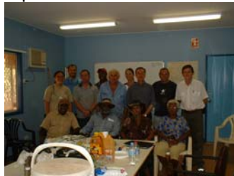
ACIAR trochus project meeting at One Arm Point

The final AGM for the project included a site visit and meeting at One Arm Point with project participants and community representatives.