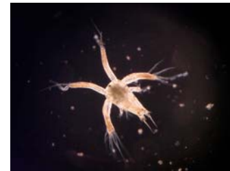
Banana prawn larvae, at nauplii stage 3, produced in hatchery trial

trip 96 banana prawn broodstock, Penaeus merguensis , were collected for hatchery production whilst black tiger prawn numbers were poor.