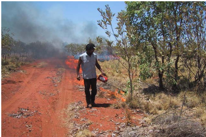
Left: Pastoral lease fire trial to control shrub densities – Bohemia Downs Station.

In January of 2003 the KRFMP began a pilot project with two Aboriginal groups to train people in both contemporary and traditional fire management to create 'Fire Control Teams'.